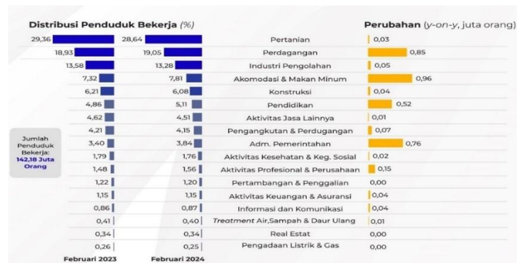
Table 1. Labor Absorption Data According to Field of Employment

Source: Central Bureau of Statistics, (2024) https://kadin.id/data-dan-statistik/ketenagakerjaan/